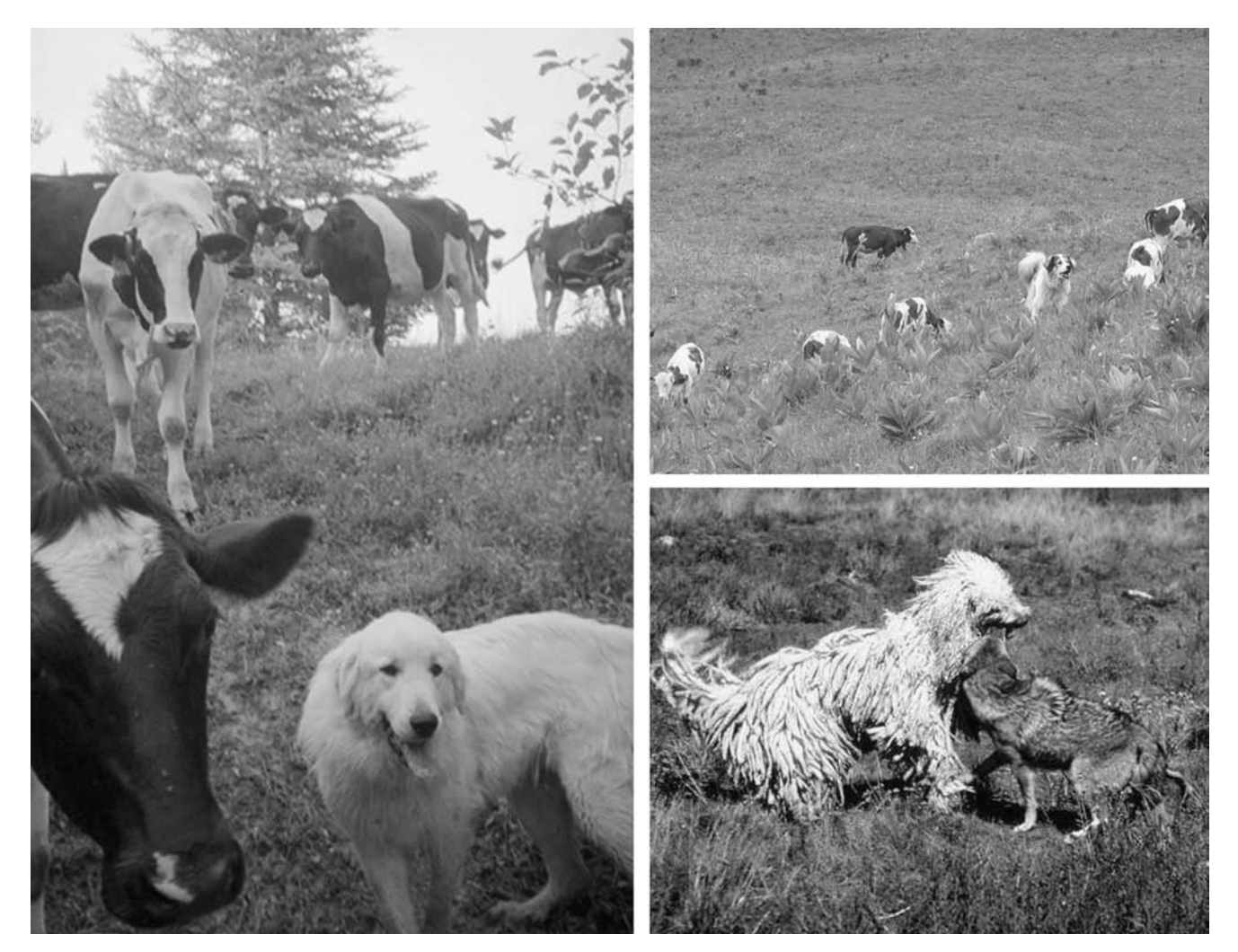
Figure 4. Effective livestock protection dogs display trustworthy, attentive, and protective behaviors.

protecting sheep and goats signify the approach's apparent effectiveness. Past reviews (e.g., Smith et al. 2000) and our research suggest that LPDs are established as effective protectors of sheep from coyotes. The broad application of LPDs for protecting livestock (including cattle) from wolves or wildlife-transmitted disease is much more tenuous and is a rich area for additional research. More rigorous research is needed to definitively assess the effectiveness of LPDs in preventing livestock depredations from wolves or reducing the risk of livestock contracting zoonotic diseases. Past studies of LPDs have been based mostly on surveys of producer attitudes relative to the effectiveness of dogs for reducing predation. Although these data are valuable, there remains a need for more science-based studies of the effectiveness of LPDs, sensu using a large-scale experimental design (Breck 2004). The few field studies that have tested the effectiveness of LPDs have had either small sample sizes or no true control (e.g., as in a before-after-control-impact design). In order for LPDs to be recommended more extensively by managers as a nonlethal management tool for reducing livestock losses due to predators (especially wolves) or wildlife