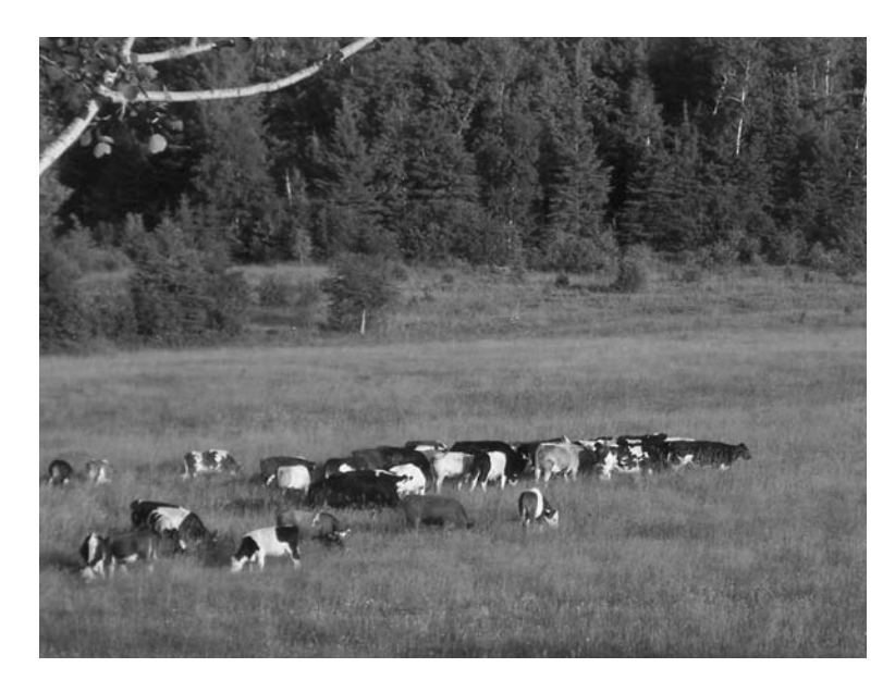
Figure 2. In the northern Great Lakes region of the United States, farm pastures are relatively small, confined grazing systems surrounded by forest. Livestock protection dogs can be fairly easily integrated into this type of grazing system.

Worldwide, there is some variation in how LPDs have been applied by producers relative to geography, the producer's husbandry practices, and grazing situations. For example, in Sweden and the Great Lakes region of the United States, LPDs are often used in fenced pastures (figure 2; Levin 2005, Gehring et al. 2006, VerCauteren et al. 2008).