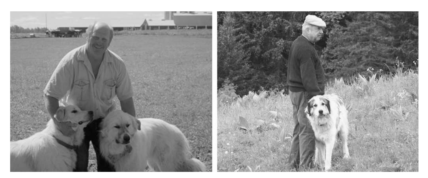
Figure 3. Livestock protection dogs (LPDs) are partners and companions in a producer's operation. The ability of LPDs to monitor pastures continuously can lead to psychological peace of mind and lower stress for producers.

However, LPDs alone may not always completely prevent predation or wildlife damage, so an integrated management strategy that employs a variety of nonlethal and lethal management tools is recommended. In the Alps, it was shown that LPDs work best together with night penning and the presence of a shepherd (Espuno et al. 2004). LPDs also could