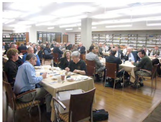
The Banquet – A time for relaxation and conversation after a successful conference.