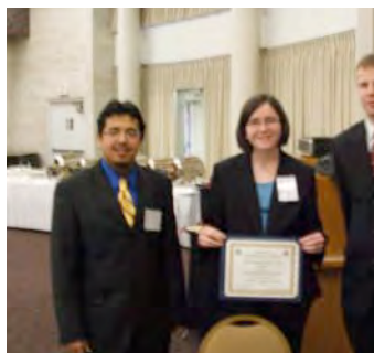
Winners, Best Student Papers