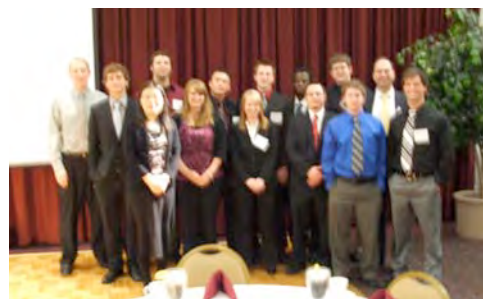
The 2011 Conference Committee